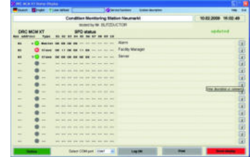
DRC MCM AL XT status display software

DIN rail mounted device with integrated LifeCheck sensor for condition monitoring of max. ten LifeCheck-equipped BLITZDUCTOR XT / XTU arresters. Transmission of the status of the bus address and BXT part numbers to the DEHNrecord Alert communication unit.