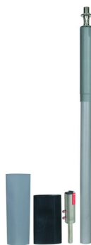
Figure without obligation