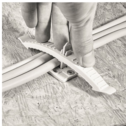
Enables the installation of cables onto metal using the TA and TB ...