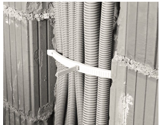
With the TA in two sizes, Schnabl has in combination with the TB a system for all requirements - on or under plasterboard