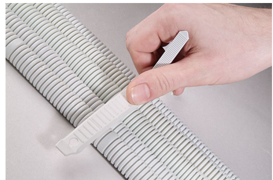
With the TB in two sizes, Schnabl has in combination with the TA a system for all requirements - on or under plasterboard