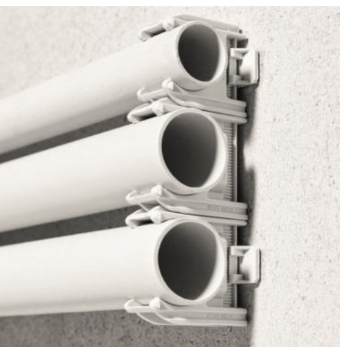
The perfect combination: ESD Euro-fastening anchor and EC Euro-clip for efficient pipe fixing.