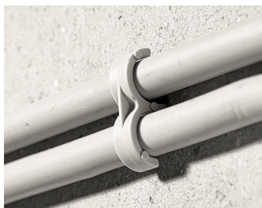
One borehole is also enough for two cables with the double fastening clamp from Schnabl.