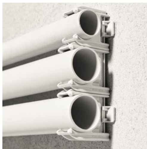
The perfect combination: ESD Euro-fastening anchor and EC Euro-clip for efficient pipe fixing.