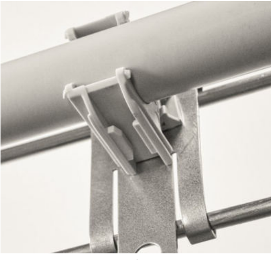
Incredibly easy appliance! The GTH Basket Tray Holder for the time-saving mounting of conduits and junction boxes on basket trays.