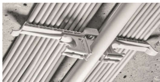
An additional EC Euro-Clip for Pipe installation can be mounted at the center of the KBS.