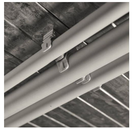
Without the need for further screws, several Basic Clips BC of different sizes can be connected by simply inserting or latching. Mounting time and costs are saved.