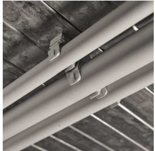
Without the need for further screws, several Basic Clips BC of different sizes can be connected by simply inserting or latching. Mounting time and costs are saved.