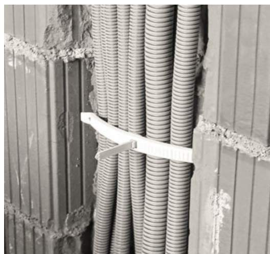
With the TA in two sizes, Schnabl has in combination with the TB a system for all requirements - on or under plasterboard