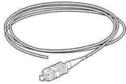
0 322 40

Cat. No(s): 0 322 40/0 322 41/0 322 42 0 322 43/0 322 44/0 322 45 0 322 46/0 322 47/0 322 48 0 322 49/0 326 24 On demand