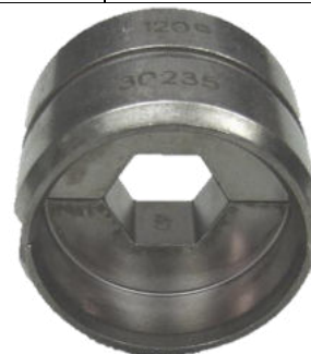
2) Powerlock Crimping Die (Example)