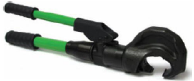
1) Powerlock Crimptool C130