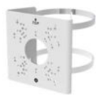
SN-CBK627D Pole Mount